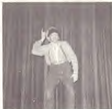
MONTREAL'S BLUE & GOLD REVUE